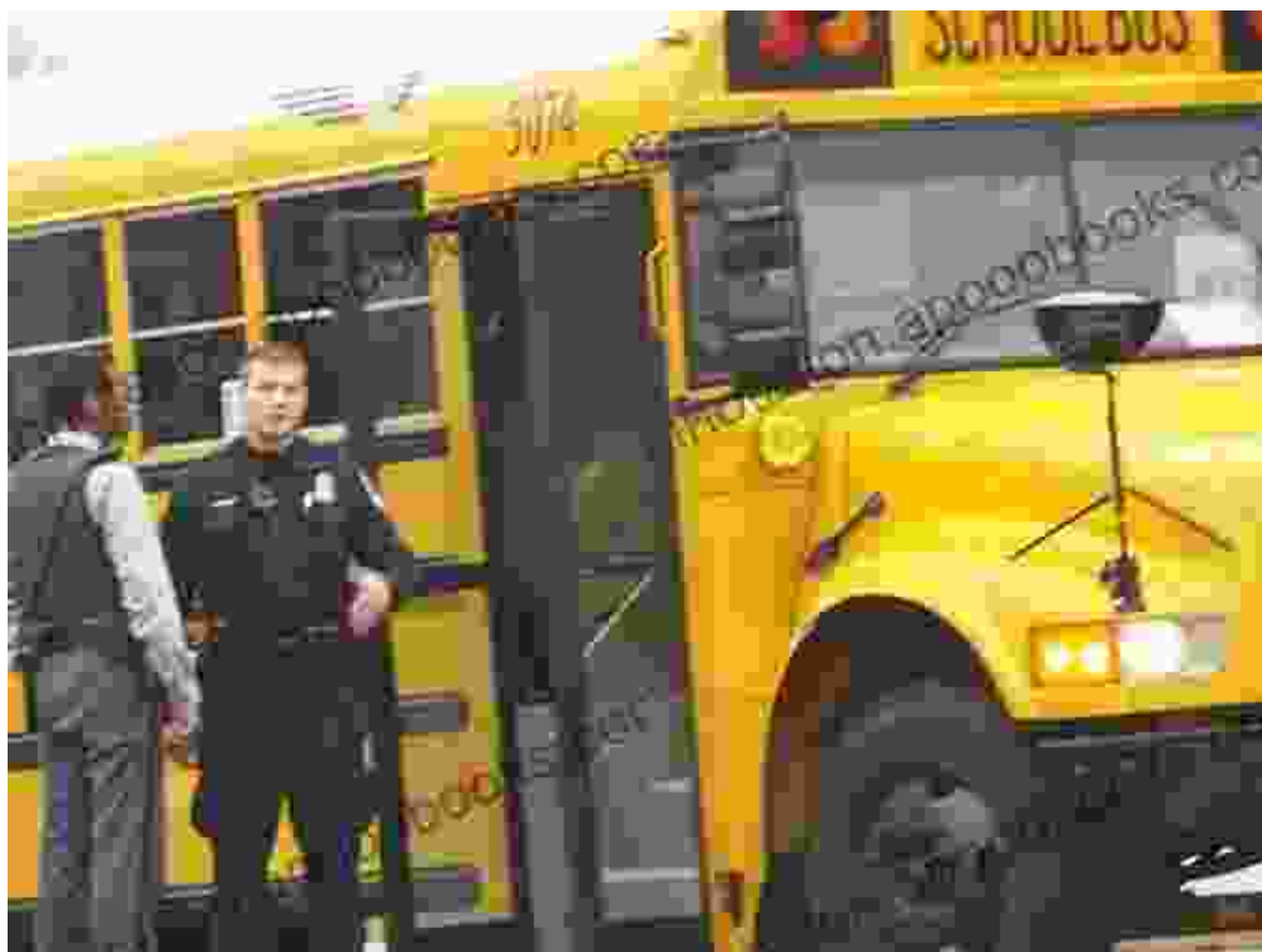
A school bus during the desegregation era.

School buses played a pivotal role in the Civil Rights Movement of the 1950s and 1960s. As schools were desegregated, buses became a symbol of racial integration and equal access to education. However, this progress was not without challenges and resistance.