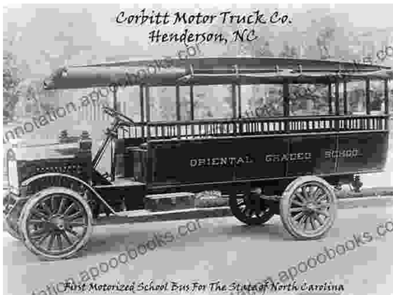
An early motorized school bus from the 1910s.

The advent of the automobile in the early 20th century marked a significant turning point for school transportation. Motorized buses, initially converted cars and trucks, began to replace horse-drawn wagons, offering greater speed, reliability, and capacity. These early buses, often open-air or partially enclosed, provided minimal comfort and protection from the elements.