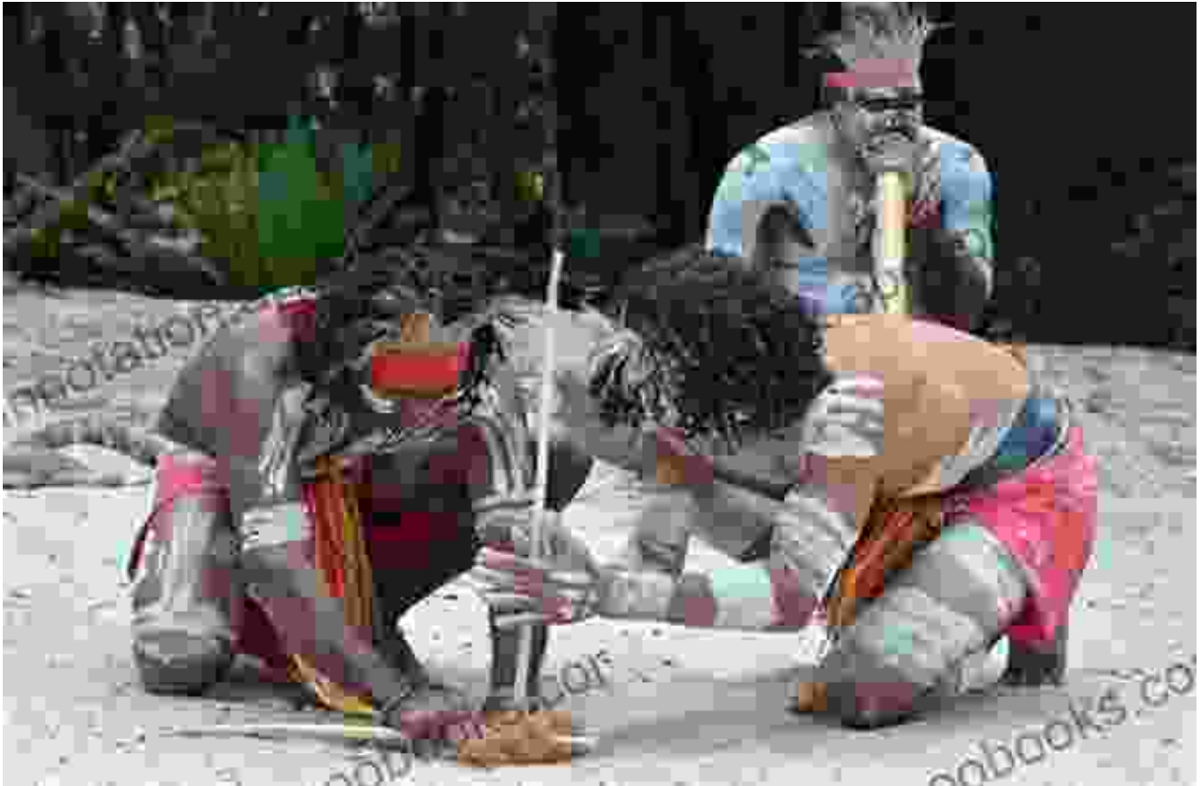
Image 6: Aboriginal Australians have made significant contributions to Australian society and culture, enriching the nation's identity.

Throughout their history, Aboriginal Australians have made invaluable contributions to the social, cultural, and environmental fabric of Australia. Their unique perspectives, cultural practices, and artistic expressions have enriched the nation's identity and heritage. From renowned artists and musicians to leaders and activists, Aboriginal Australians have played crucial roles in shaping contemporary Australian society. Their resilience, creativity, and commitment to social justice continue to inspire and uplift the nation.