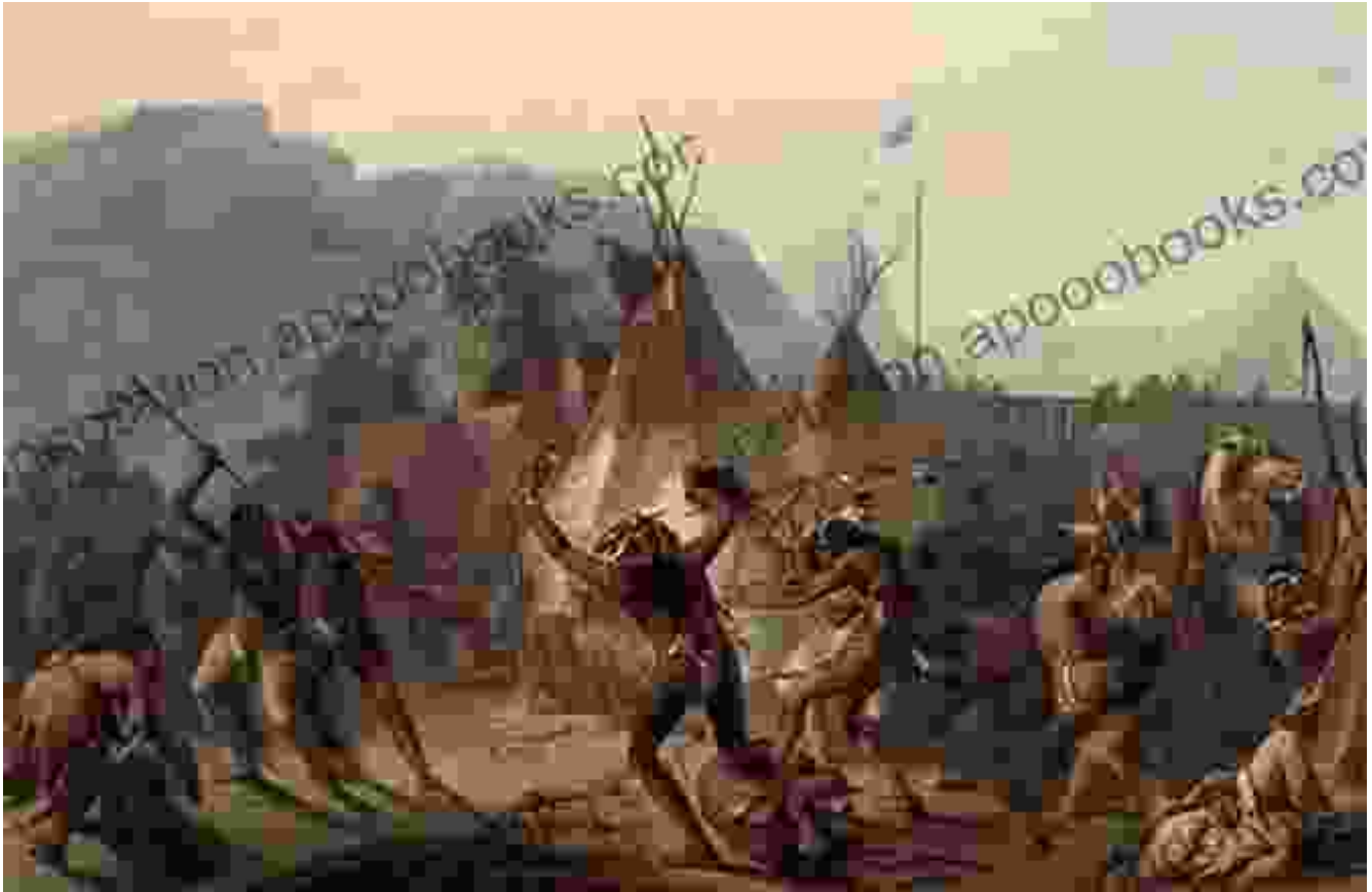
Image 2: Aboriginal warriors fiercely defended their territories against colonial encroachment, demonstrating their unwavering resilience.

Aboriginal Australians met colonial expansion with fierce and steadfast resistance. From armed conflicts to cultural preservation, they fought to protect their ancestral lands, their sovereignty, and their cultural identity. Notable figures such as Pemulwuy, Windradyne, and Yagan emerged as symbols of Aboriginal defiance and resistance. Despite overwhelming odds, Aboriginal communities exhibited extraordinary resilience, adapting to the challenges of colonization while preserving their cultural heritage.