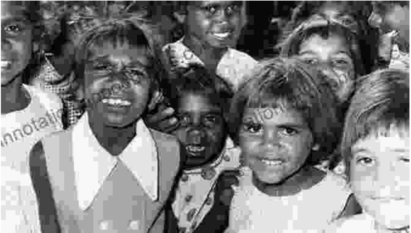
Image 4: The Stolen Generations represents a dark chapter in Australian history, where Aboriginal children were forcibly removed from their families.

One of the most tragic episodes in Aboriginal Australian history was the Stolen Generations. From the late 19th century to the 1960s, government policies forcibly removed thousands of Aboriginal children from their families and placed them in white institutions. This practice aimed to assimilate Aboriginal children into white society, resulting in profound trauma and loss of cultural identity for generations of Indigenous Australians. The Stolen Generations cast a long shadow over Aboriginal