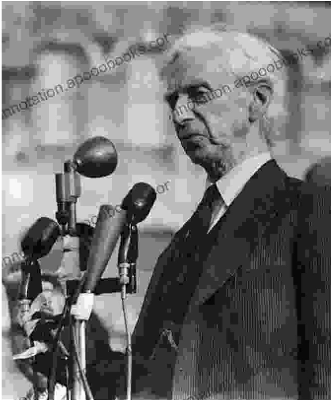
Challenging Nuclear Supremacy

The book chronicles the inspiring tales of courageous individuals who defied societal norms and political pressures to confront the existential peril posed by nuclear weapons. From the civil disobedience campaigns of the civil rights era to the grassroots movements that emerged during the height of the Cold War, these stories highlight the power of human resilience and the transformative potential of activism.