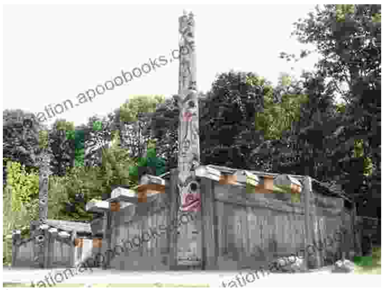
Chapter 2: The Road to Repatriation

The authors deftly trace the profound consequences of these colonial policies, highlighting the fragmentation of Haida families, the loss of cultural knowledge, and the deep-seated wounds inflicted on a proud and resilient people.