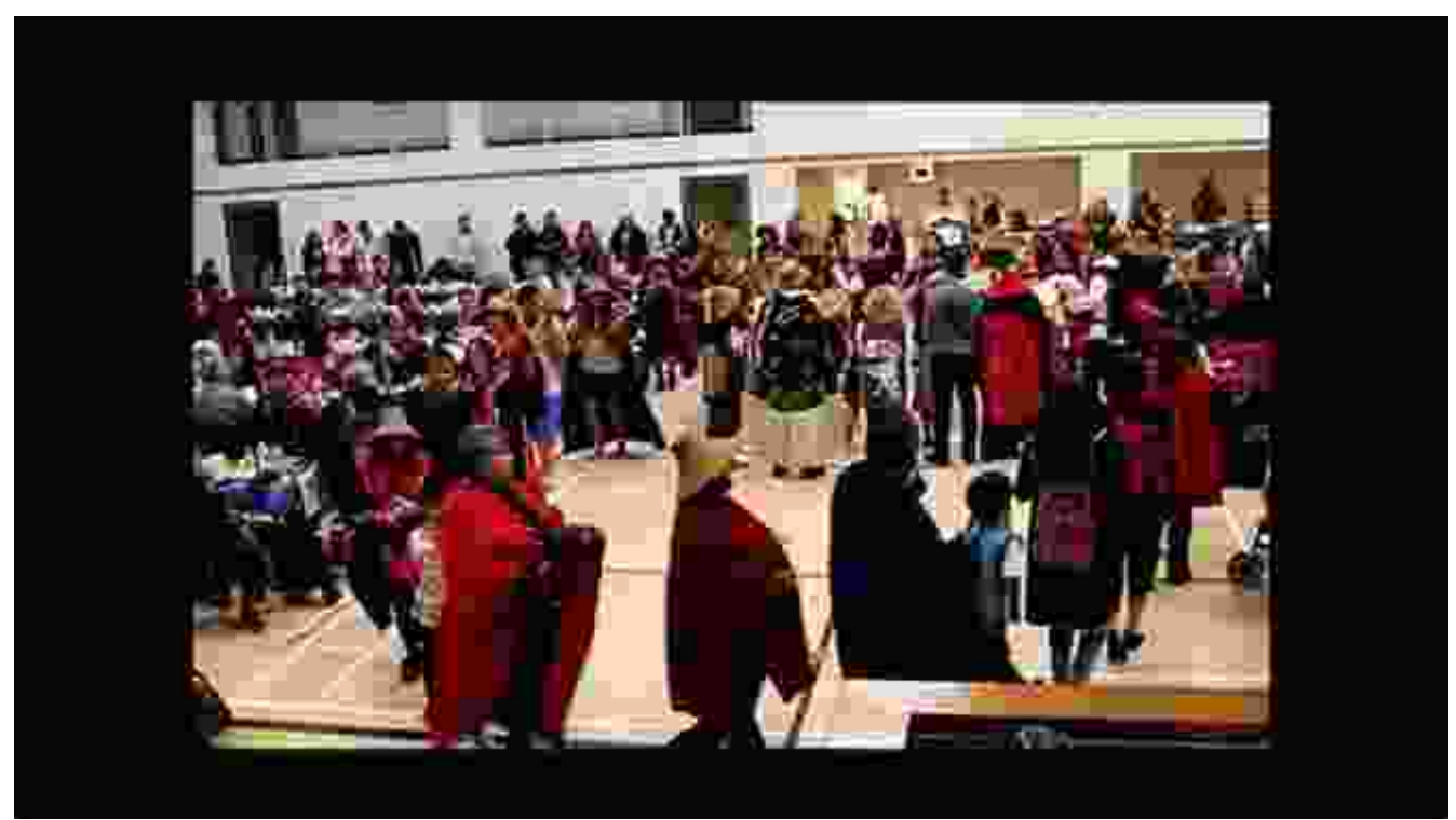
Chapter 4: Memory, Reconciliation, and the Future

Through intimate portraits of Haida elders, cultural practitioners, and community members, the book explores how repatriation has strengthened kinship networks, sparked cultural revitalization initiatives, and empowered Haida people to reclaim their cultural legacy.